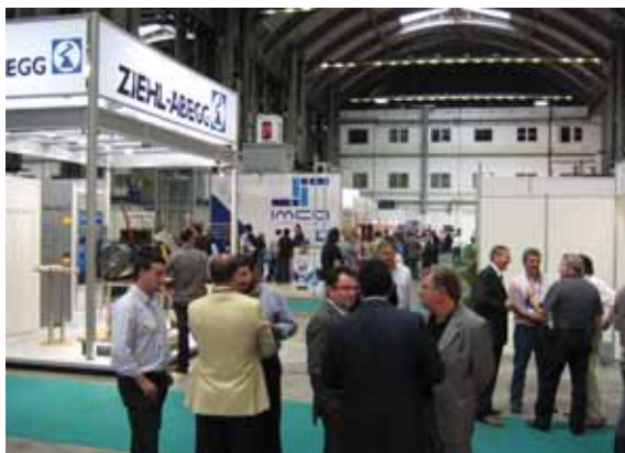
Photos from Ele-Espan 2009 exhibition. First to: KLoean delegation meeting with the management.

The modern trade fair tradition in Barcelona began with the Universal Exposition in 1888 and although the first trade fair was held in 1920, the Feria Internacional de Barcelona organisation was not officially constituted until 1932. The International Exposition was held in 1929. The Fira de Barcelona plays a strategic role in the Catalan and Spanish economies as a platform for the economic promotion and international projection of companies. With its commitment to innovation, quality, added-value products, knowledge, design and scientific and technological research, the Strategic Plan for 2006 - 2015 is strongly supporting international exhibitions and events, strengthening Barcelona's position as the most outstanding platform in southern Europe for major sector meetings. Other objectives include introducing new lines of business and offering outstanding levels of service to exhibitors and visitors.