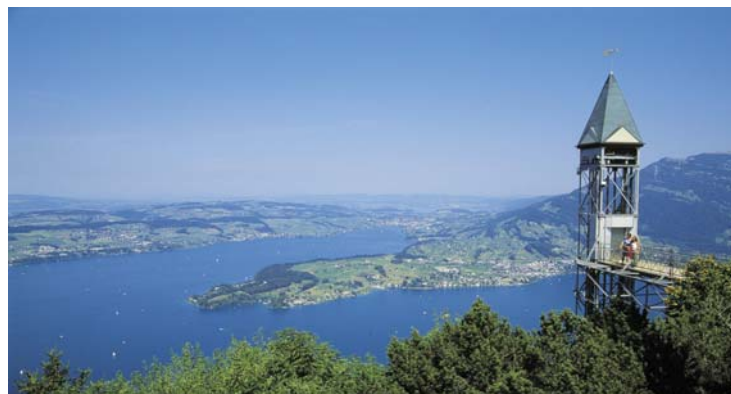
The Hammetschwand lift which is Europe's highest outdoor lift

At approx. 15:00 hrs departure from Lucerne by boat. We shall take the funicular to go up to Buergenstock, where we shall see the Hammetschwand lift which is Europe's highest outdoor lift and travels a vertical distance 152m in less than a minute. We shall go up by lift to Hammetschwand and return to the lift station from where a short walk will bring us to the Buergenstock hotel. Participants who do not wish to hike can stay in the hotel area and enjoy an aperitif. Around 19:30 hrs we shall dine at the Buergenstock Club returning at night to Lucerne. (this is a provisional itinerary, subject to changes)