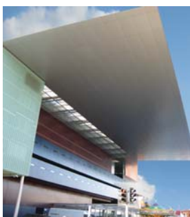
The Lucerne KKL Congress Centre

The programme with the timetable detailed presentations will be available on www.elevcon.com from 15 May 2010