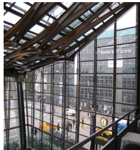
The KKL congress centre, View from the main train station building

The information about the hotels was taken from hotel publicity and IAEE has no responsibility for its content.